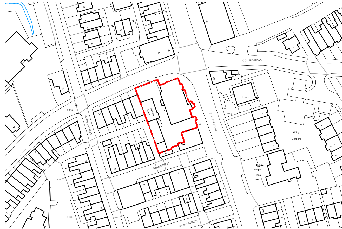
LOCATION PLAN - 1:1250